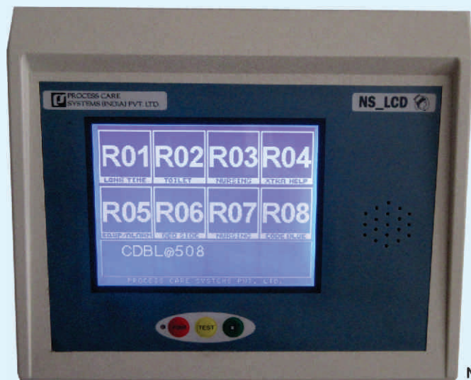
Nurse Station Display