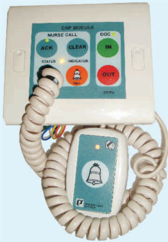
CNP MODULE (DFRU)